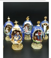
Art & Home