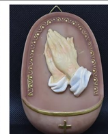
Holy Water Fonts