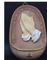
Holy Water Fonts