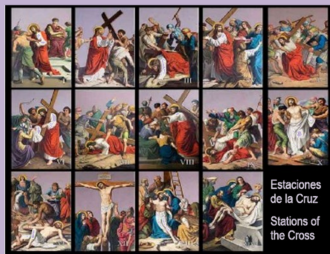
Estaciones de la Cruz Stations of the Cross

Muchas gracias por su continua generosidad hacia St. James.