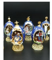
Art & Home