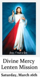
Divine Mercy Lenten Mission Saturday, March 16th

The 2023 Parishioner Giving Reports are available at the Office.