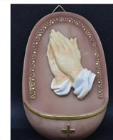
Holy Water Fonts