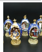
Art & Home