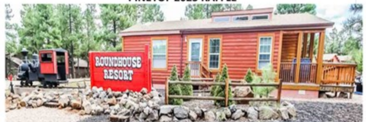
THE PRIZE FOR THE PINETOP 2023 RAFFLE

Extended 1 Week, Ends this Tuesday, May 16th — See Page 11