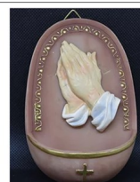
Holy Water Fonts