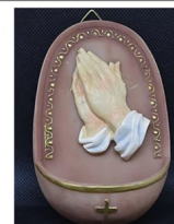
Holy Water Fonts