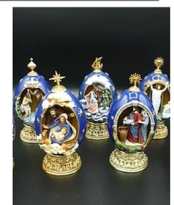
Art & Home