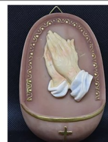
Holy Water Fonts