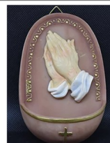
Holy Water Fonts