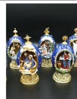
Art & Home