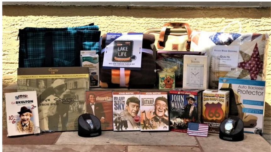
Step Back in Time Raffle

https://stjamesgreater.rallyup.com/beachfun/