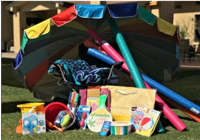
Beach Fun Raffle

https://stjamesgreater.rallyup.com/beachfun/