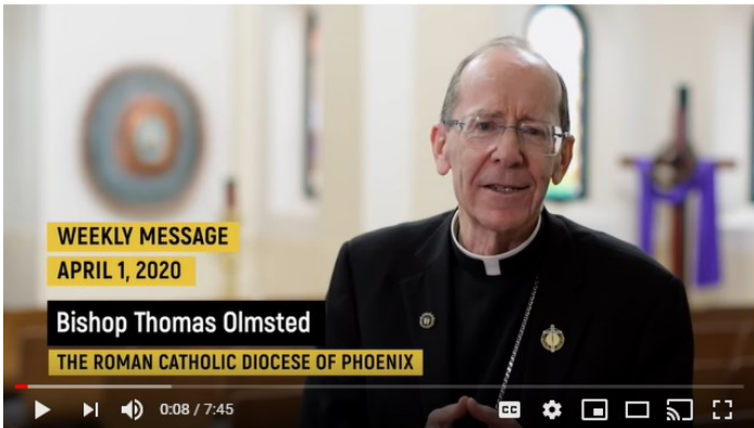
Watch the weekly message from Bishop Olmsted (April 1, 2020)

https://www.youtube.com/watch?v=N7WpyJINq5M