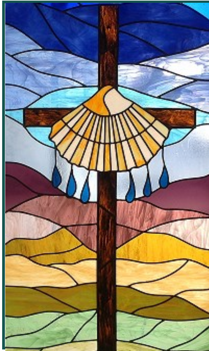
THE MOST HOLY TRINITY June 14-14, 2014

“Ulko Mgeni Hapa Mara Moja Tu.” (Swahili—Spoken in East Africa) + “In Wendo Kani Dichiel Kende” (Luo—Spoken in Western Kenya.) + “Tu, tylko raz, człowiek pozostanie nieznanym.” (Polish) + “Egy idegény vagy itten csak égszzer.” (Hungarian) + Nyi dia amu ni tete vu alu adite (Madi—spoken in Northern Uganda) + “Uri Muenzi Kamwe.” (Chishona, spoken in Zimbabwe.)